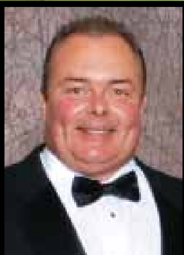
♣ TIM CRUISE ♣